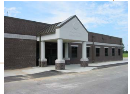
McEntire Air National Guard Station Surgeon Annex

Monteray has a long history of working with McEntire, and we look forward to continuing this relationship in the future.