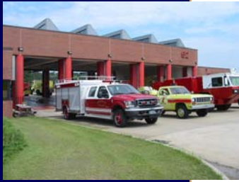
McEntire Air Force Base Fire Station Upfit

Monteray completed in June extensive renovations and upfits at the McEntire Air National Guard base Fire Station.