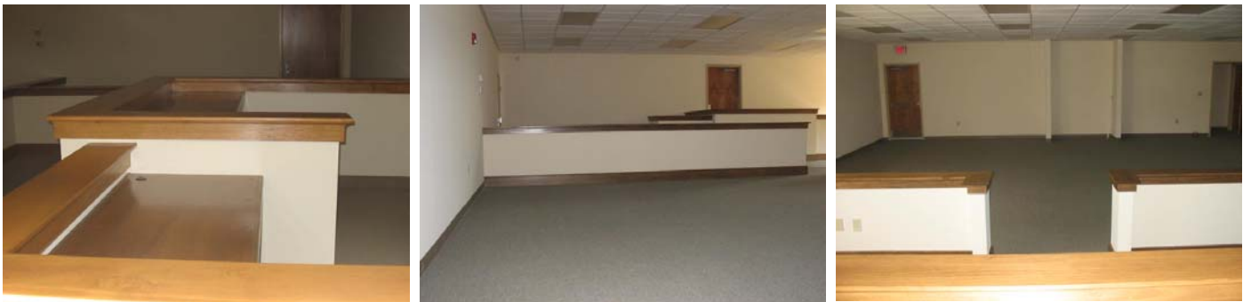
Courtroom After Construction