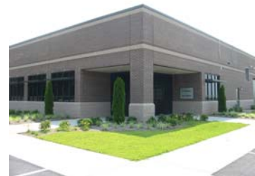
Final Product: LEMA Company Building, McEntire ANG Station