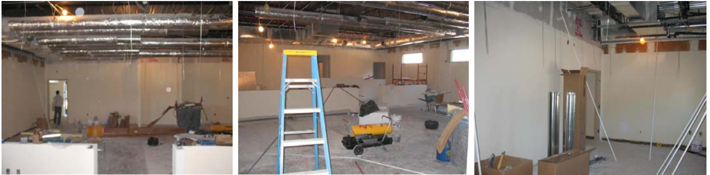
Courtroom During Construction