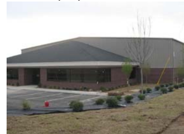
Near Complete: Hinson Cabinets, Shop Road